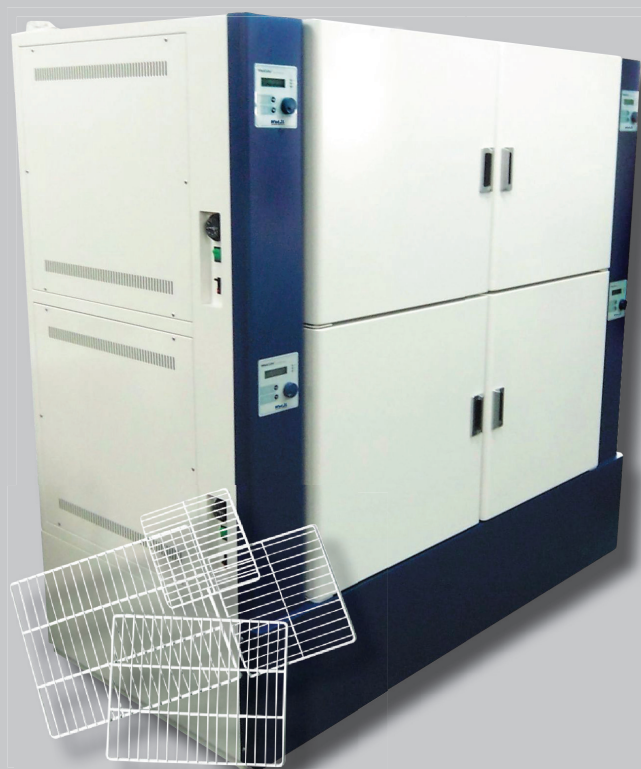
WIM-R4 with Jog-Shuttle controller and 8x PE-coated steel shelves (included)