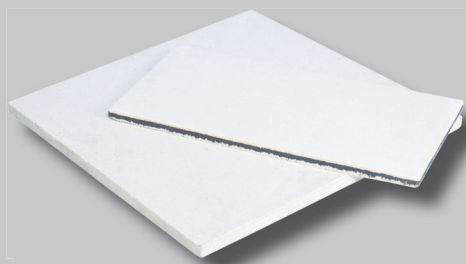
FP-14 with ceramic fiber plate (included)