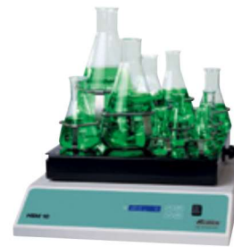
HSM 10 ( set 3 ) including platform for Erlenmeyer flasks, with a set of 18 clamps of different sizes