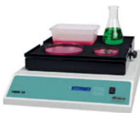
HSM 10 ( set 2 ) including platform (anti-slip mat) for a wide range of containers