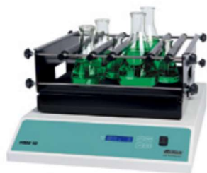
HSM 10 ( set 1 ) including the universal platform (5 tension rollers) for different vessels