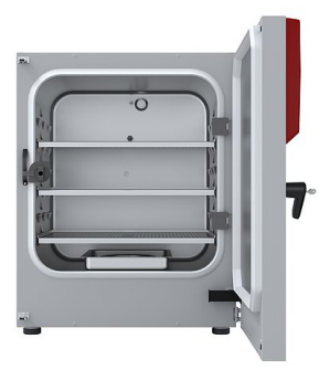
Model CB 170