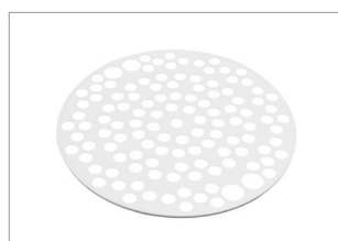
Perforated sample tray for VDR