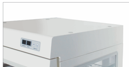
Foot alignment grooves for stacking (for DCL/DC-11, 21S)