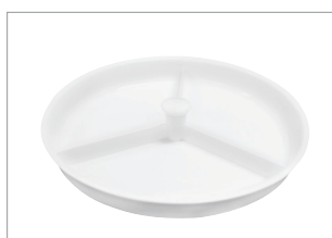
Drying agent tray for VDR