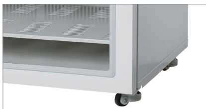
Casters (for DCL/DC-41)