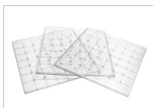
Perforated sample tray for VDC