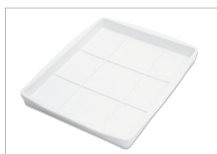
Drying agent tray for VDC