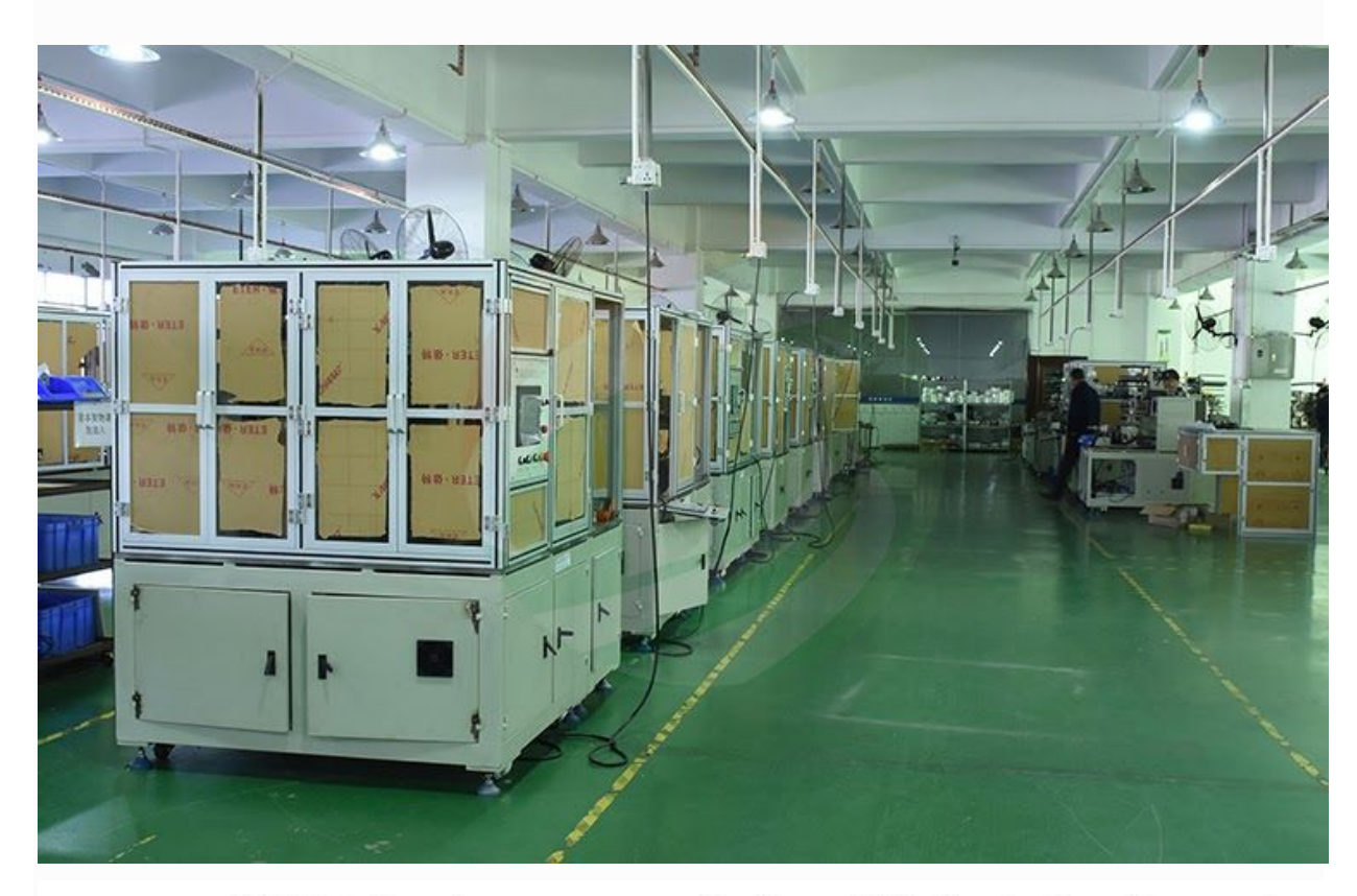
Suitable battery size