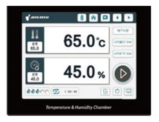
Color touch display controller(5.6 inches)