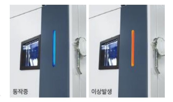
Indicator LEDof product condition