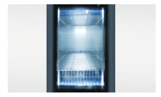
Tempered glass windowwith wire heater and LED lamp