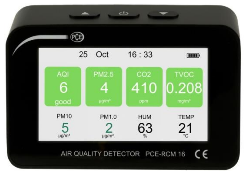
Figure 1Standard view