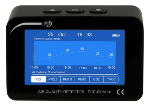
Figure 3Graphic view