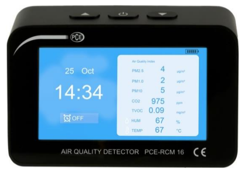
Figure 2List view