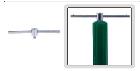
T-bar wrench (only for IST-MG250, IST-MG360, IST-MG600)