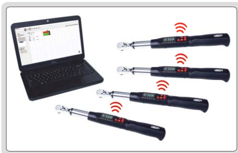
a computer can be connected with multiple wrenches, the transmission distance is 10 meters (no obstacles, no electromagnetic interference)