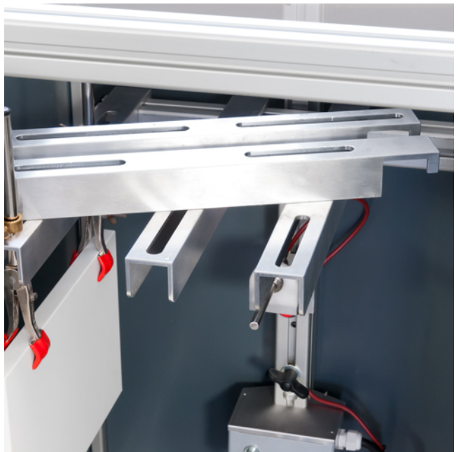
Test Cabinet for Damp Tests / based on AMK-MB-005 / automatic test sequence/ for up to 5 test pieces

With the evaporation cabinet PCE DLT 10, the water vapour resistance of samples is tested according to AMK-MB-005 Issued on 04/2015 Humidity and Climatic Resistance Test Module 1 (watervapour loading). This test simulates the conditions of cooking hobs or dishwashers. The samples to be tested are vertically suspended in the narrow area of the PCE DLT 10 material test chamber. Then you have to steam the sample for 3 cycles of 30 minutes and leave it to dry for 30 minutes outside the device. After the test, the samples are to be assessed visually and haptically for damage such as swelling, joint formation and detachment. The aim of this test with the evaporation cabinet PCE DLT 10 is to prevent any swelling, joint formation or edge / film detachment on the test piece. The quality of the joint determines the component quality. A closed joint prevents the penetration of moisture.