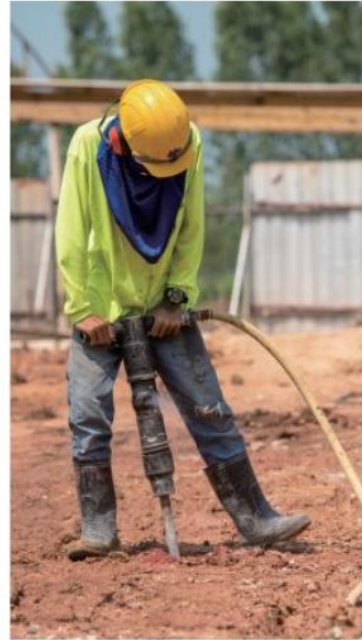
CB-10 / CB-20 / CB-30 / CB-35 Concrete Breaker ("R"= Round Shank)