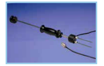
Similar to 26-ES, the 18-ES has a 17" steel shaft. Comes with 608 insulated pins for 3 1/4" penetration. Ideal for timber, poles, and ties.