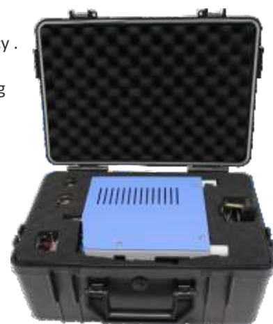
Carrying Case (optional)

Compact Sized Design (12x20x22.5 cm - WxDxH), Less Weight (5.8 kg / 4.4 kg) . Easy to carry to the field for on-site calibration . Very useful tool designed to carry out temperature calibration especially for all the thermal calibration laboratory