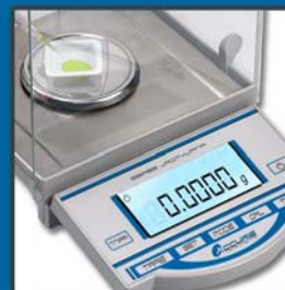
Available with Quick-Cal™ auto calibration