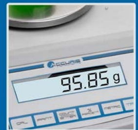
Large, backlit LCD display