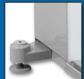
Extended base, limits vibration & improves stability