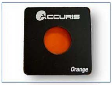
Orange photo filter, optomized for smartphone imaging