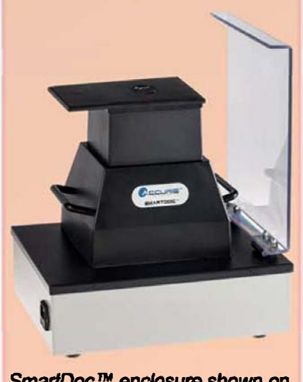
SmartDoc™ enclosure shown on Accuris UV Transilluminator* "UV Transilluminator is not included.

*UV Transilluminator is not included. Optional filter required for UV imaging.