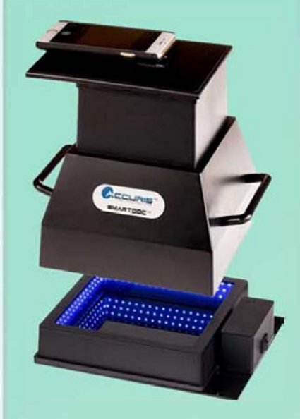
Imaging enclosure fits over the blue light illumination base