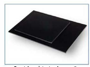
Scratch resistant gel prepration and cutting platform