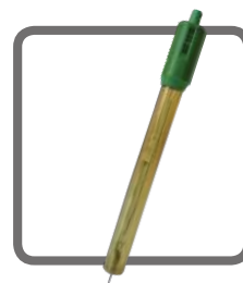
Optional AD3230B - ORP electrode [AD111]

Auto-off after 8 minutes of non-use conserves energy and lengthens battery life-span.